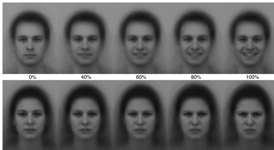
Figure 1: Example of the visual stimulus used, based on the Karolinska Directed Emotional Faces (KDEF), Lundqvist, Flykt, and Öhman (1998).

The study was conducted in two stages. First, all participants were shown a sequence of pictures portraying different human facial expressions of emotions. There were seven different emotions depicted (neutral, happy, angry, afraid, disgusted, sad, surprised) (See figure 1) based on the Karolinska Directed Emotional Faces (KDEF). The images are all black and white and slightly blurred. This is to minimise the risk of individuals using non-emotional cues such as colour tones to determine the expressed emotions, Lundqvist, Flykt, and Öhman (1998). At the same time, biometric data of the electrical activity in the brain as a result of the visual stimuli were recorded using an electroencephalogram (EEG). This measurement was after initial calibration readings were obtained from each participant. This calibration ensured that a baseline reading was recorded in a non-stimulated environment.