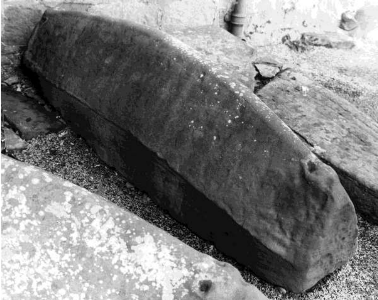
Figure 2. Cross Canonby 5C/D (Cumbria): hogback, type f (after Bailey & Cramp, 1988, pl. 233).

might be evoked too: Odin's Valhalla could be envisioned, as suggested for the commemorative context of the hog-backed hall on the Gotlandic picture-stone known as Tjängvide I (Schmidt, 1973: 63; Graham-Campbell, 2013: 161; see also Eriksen, 2013). Alternatively, the shrines of saints, or the churches of Rome or Jerusalem, may have been evoked through the allusions to canopies displayed by the recumbent stones (Lang, 1984; Williams, 2015, see below).