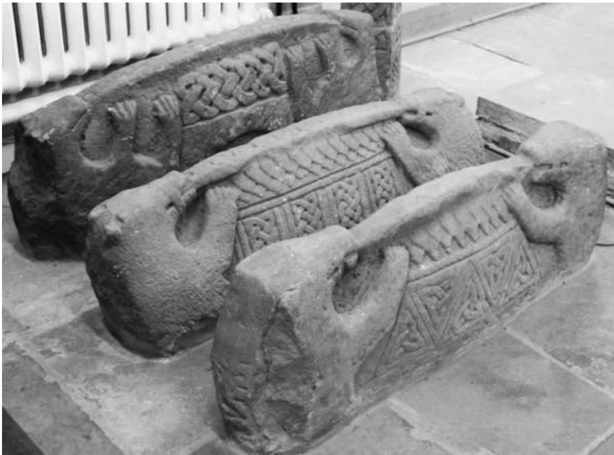
Figure 1. Hogbacks at Brompton (North Yorkshire), from left to right, types a (Brompton 17 and 19) and c (Brompton 20).

of hogbacks is a challenge for their interpretation: the subtypes are very different from each other. For example, some stones have large end-beasts (most often resembling bears), others have diminutive end-beasts (which could be ursine or dragonsque), while further examples display none at all. Their shape and side decoration vary considerably too. Monument subtypes also have overlapping distributions and different subtypes appear together at the same locations, making both the identification of regional types and the relative dates of monuments challenging. Unsurprisingly, given this host of factors, while they are usually regarded as 'tenth century', the duration of making and using hogbacks, and their precise functions, remains unclear (see Williams, 2015). There also remain questions regarding why some places have these recumbent stones, whereas neighbouring ecclesiastical sites, while producing tenth–eleventh-century sculpture and other archaeological evidence, might not produce any.