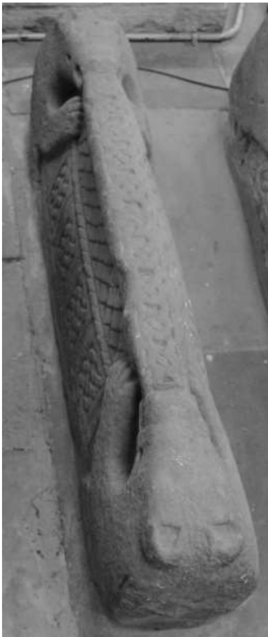
Figure 4. Brompton 17.