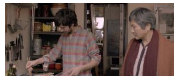
Scene 2: cooking bacon with chopsticks.

“I think the concept of gay is more and more accepted in Chinese culture. Look, the British guy can use chopsticks to cook bacon for the boy. They really love each other”. “Apart from gay, other concepts such as girls over 30 years old still not married (大齡剩女), young couples do not