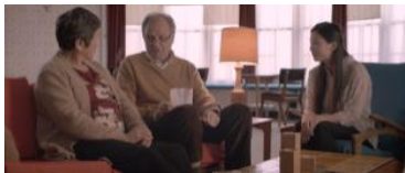
Scene 1: dating with the help of a translator

For example, Lilting , a BBC film about Chinese culture, British culture, the generation gap, etc., was shown in class. The story spreads around four characters: a Chinese mom with little English was put in a care home in London by her son who thinks it is a responsible way to take care of his mom. The son’s boyfriend (gay) can hardly get the mom’s approval for their gay relationship. A British man in the care home is fond of the mom but can hardly communicate with her because of the language barrier. The misunderstandings, miscommunications, and different cultural norms initiated heated discussions among students.