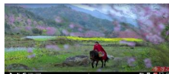
Figure 2 Avoid crowds, and feel the spring