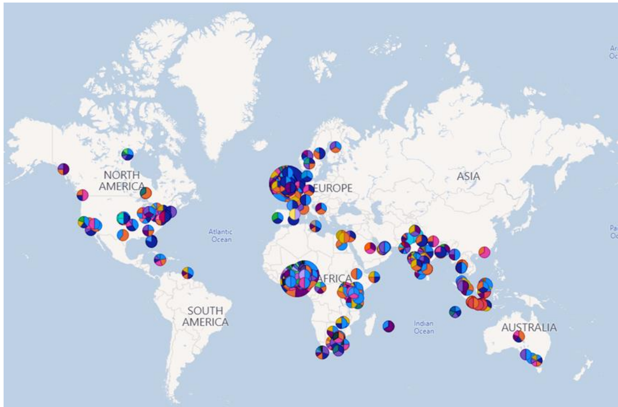
Figure 1. Geographical Distribution of Users Across X

Figure 1 provides an overview of the location of users posting from around the world plotted onto a map.