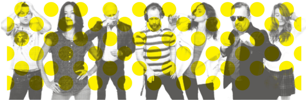
FIG. 1. MARKETING POSTER FOR IRVINE WELSH’S ECSTASY BY HEYDON (2012).

Based on the #1 book by Irvine Welsh author of ‘Trainspotting’