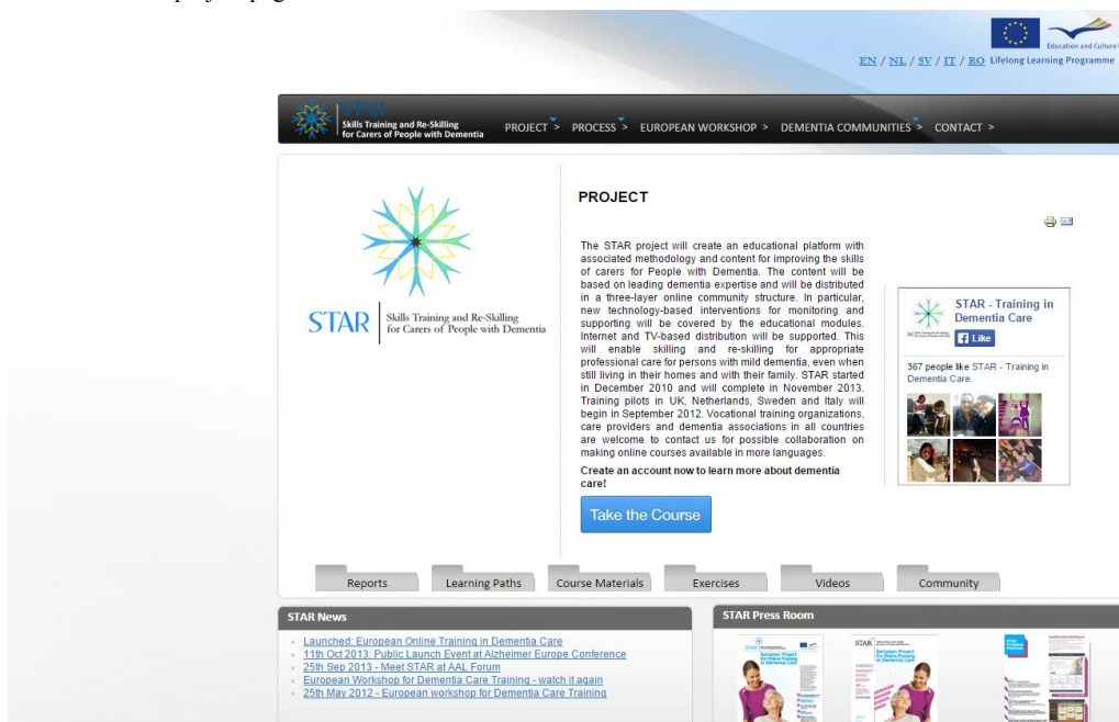
Figure 1. The main project page.

After development and testing of the training portal and e-learning course material during the first phase of the STAR project, the STAR training portal was evaluated in a randomized controlled trial (RCT) in the Netherlands and the United Kingdom from May 2013 to March 2014. The primary aim of this evaluation was to assess STAR's usefulness, user friendliness, and impact on knowledge. Because the themes of the course, in addition to factual knowledge on the dementia syndrome, focus greatly on dealing with dementia and understanding dementia (eg, themes such as "adaptation and coping," "positive and empathic communication," and "emotional impact and looking after yourself as a caregiver"), the impact on empathy, attitudes, and sense of competence were studied as well. The aim of this paper is to describe the results of these different types of user evaluations.