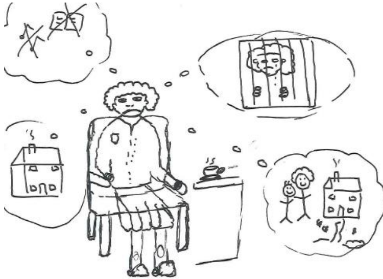
Pre-placement image reflecting perceptions of nursing homes

The transition in perceptions was notable in the post-placement focus group: they now appreciated their learning experience and were proud of their achievements. Importantly, the drawings were more positive portrayals of nursing homes and were more individualised, as evidenced in the image below.