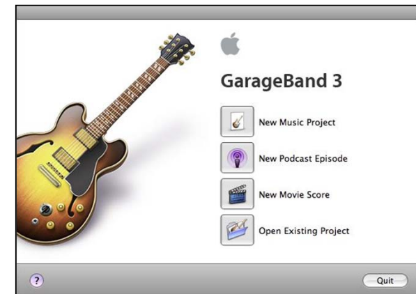
Editing and compressing: iTunes and GarageBand