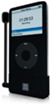
Recording: iPod with microphone attachment